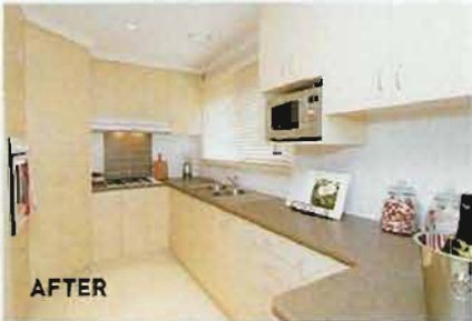
Upgrading the tiles, benchtop and flooring made this kitchen look new.