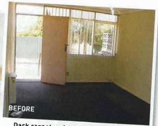
BEFORE Dark carpet and dated paintwork made this old-fashioned room feel tiny.