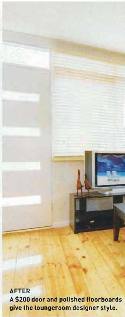
AFTER A $200 door and polished floorboards give the loungeroom designer style.

My role is to find the renovation projects then source the finance.